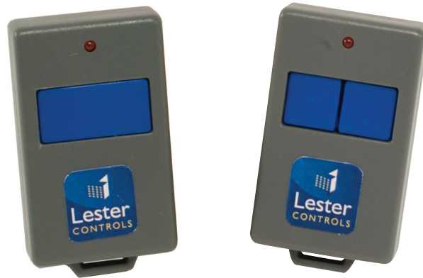
1 Button Zapper