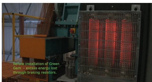
Before: Excess Energy Lost Through Braking Resistors