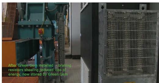
After: Braking Resistors Showing Reduced Loss Of Energy Now Stored By Green Gem